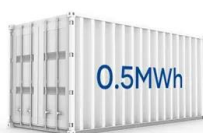
Standard 20ft containers